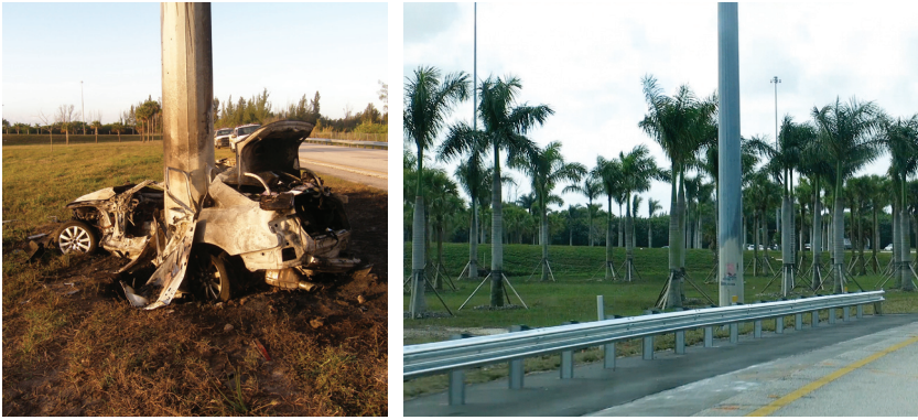
ATTORNEYS: POORAD RAZAVI // DONALD R. FOUNTAIN, JR.